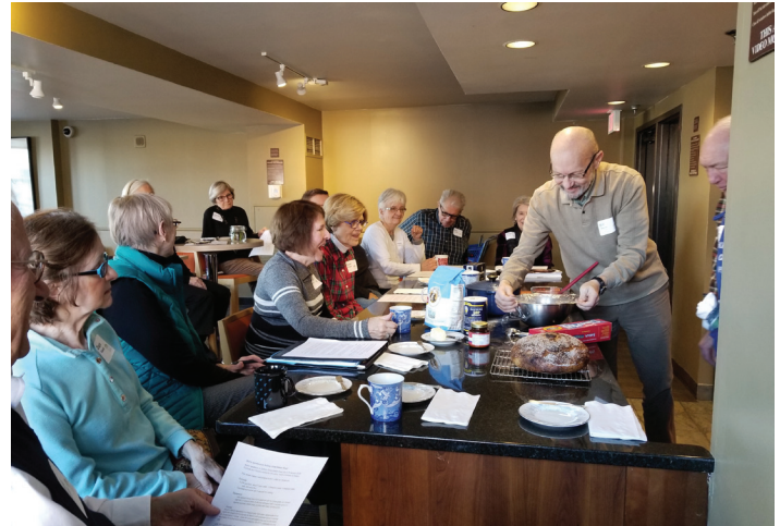
Mill City Commons members enjoy a wide variety of programs and services and have had great success with their three-month trial membership.

Mill City Commons: We learn. We share. We engage. We give.