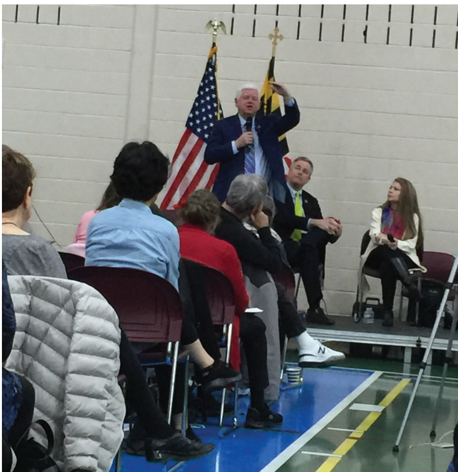
Congressman John Larson speaks to attendees at a Seniors Workshop in Gaithersburg, Maryland on March 26.