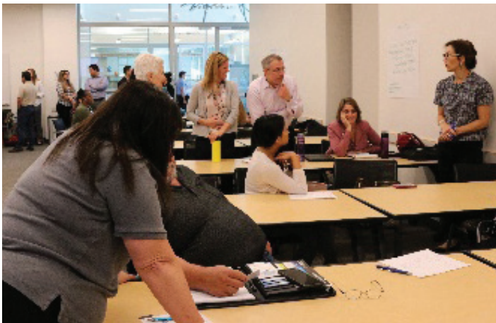
Attendees of San Diego workshops in mid-March focused on launching a Village and organizational partnerships.